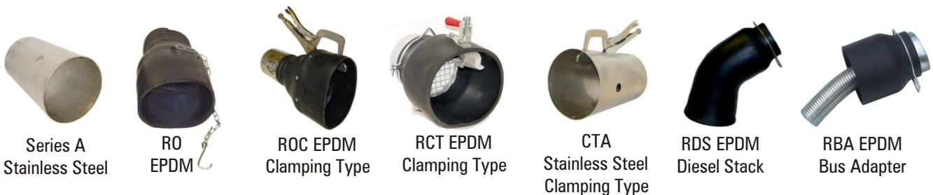
Series A Stainless Steel

Car-Mon has an exhaust adapter for all types of vehicles. If you have a special vehicle or application, we will design an adapter to fit your needs. Custom adapters available.