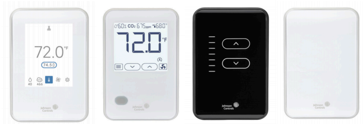
Figure 1: NS8000 Series Network Sensor models

The NS Series Network Sensors function directly with Metasys® system Field Equipment Controllers (FECs), Metasys Network and Control Engines (NCEs), Advanced Application Field Equipment Controller (FACs), Metasys VAV Box Equipment Controllers (CVM) and General Purpose Application Controllers (CGM), VAV Modular Assembly (VMA16) Controllers, and Facility Explorer™ FX-PC Series Programmable Controllers (FX-PCGs, FX-PCVs, and FX-PCXs). The sensors are also compatible with Verasys® and Johnson Controls® Smart Equipment.